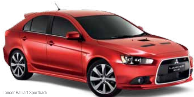
Lancer Ralliart Sportback