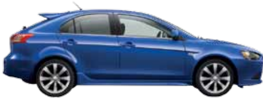
LIGHTNING BLUE (P)

A range of fashionable and sporty colours to allow you to personalise your Ralliart sportback or sedan.