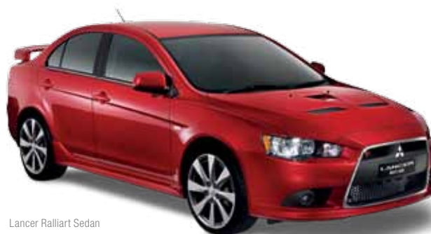
Lancer Ralliart Sedan